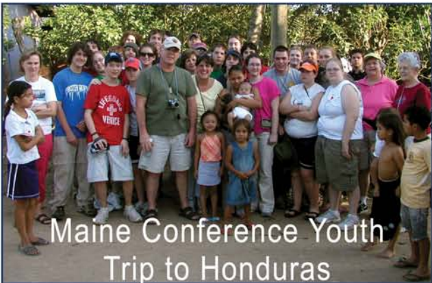
Maine Conference Youth Trip to Honduras