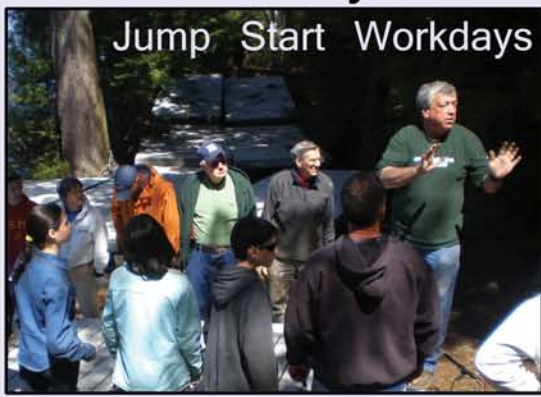
Jump Start Workdays