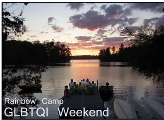
Rainbow Camp GLBTQI Weekend

Gay, Lesbian, Bisexual, Transgender, Questioning and Intersex men and women 21 years old and older