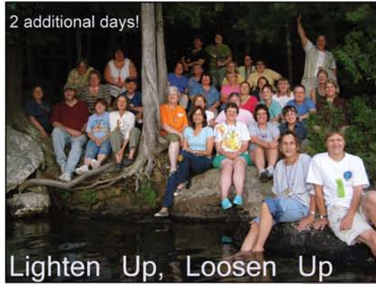
2 additional days!