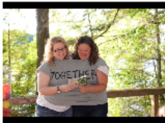
SUPER COOL STAFF