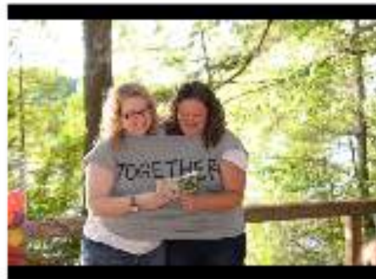
SUPER COOL STAFF